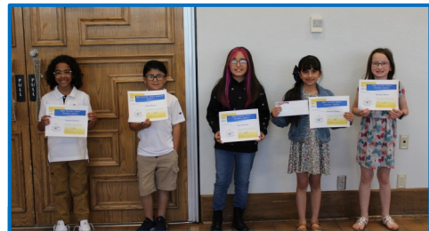
2023 Coloring Contest Winners. Not all pictured.