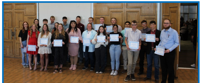
2023 High School & Returning College Student Scholarship recipients. Not all pictured.