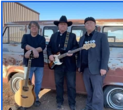
The Pony Creek Trio band did a fantastic job keeping us all entertained!